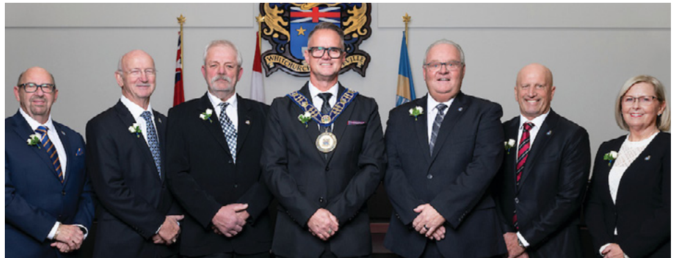
Mayor and Council