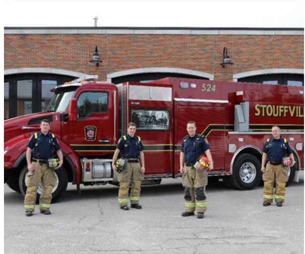
Tanker 524 – 2023 Kenworth T880

BUSIEST TIME OF DAY FOR CALLS 2 pm (112)