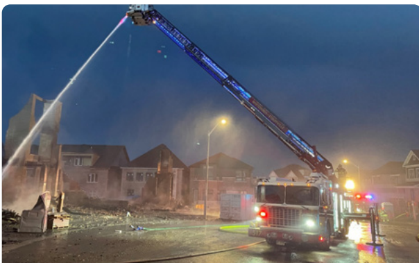
Mutual Aid response to Richmond Hill Jul 20-2023

In the fall of 2022, the Town was fortunate to acquire a piece of property at 4902 Aurora Road. This will be the new location for the relocation of Station 5-2 with an anticipated completion date in 2026. This new facility will be a partnership with York Region Paramedic Services.