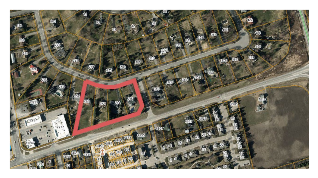
Figure 1 – Aerial View and Surrounding Area

Figure 1 below shows an aerial view of the Subject Lands at 268-296 Cam Fella Boulevard, located west of Mohawk Gate, and the surrounding area.