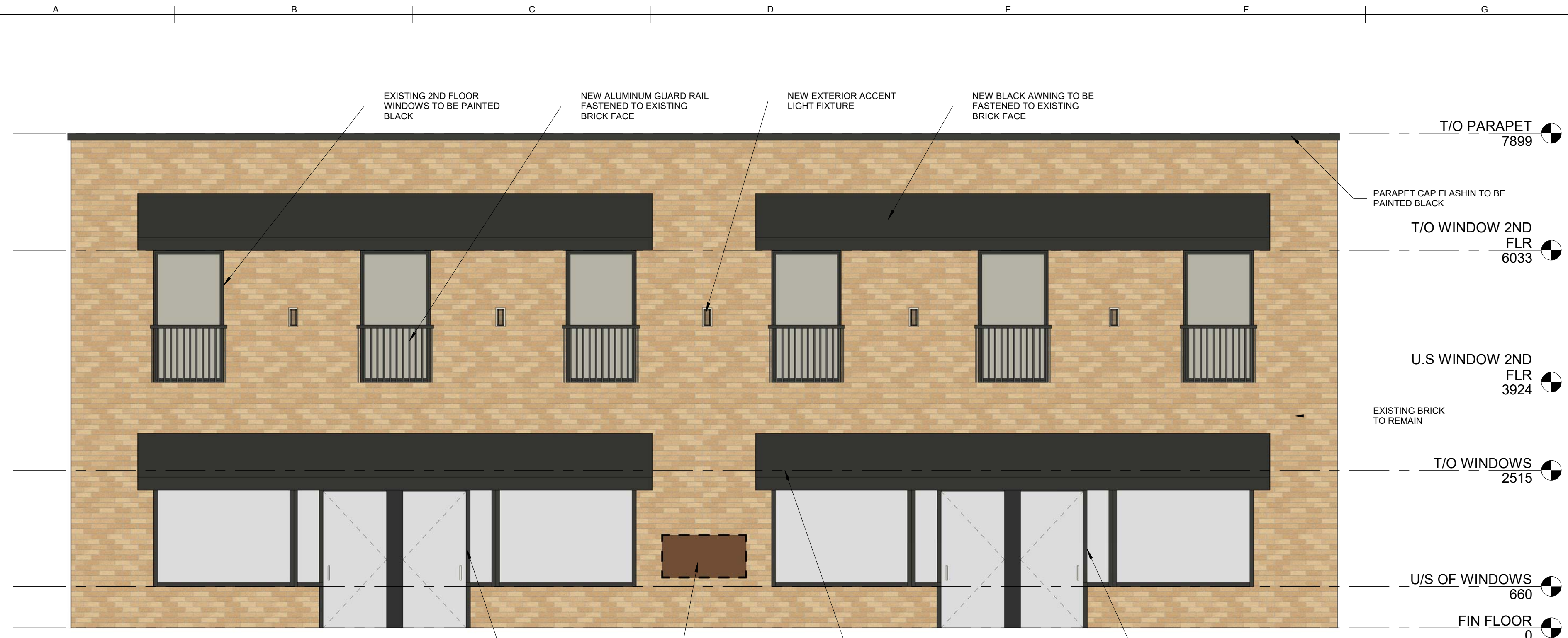
2 FRONT ELEVATION 1:50

EXISTING STOREFRONT TO BE PAINTED BLACK HERITAGE PLAQUE LOCATION TO BE COORDINATED WITH LOCAL HERITAGE COMMITTEE NEW BLACK AWNING TO BE FASTENED TO EXISTING BRICK FACE EXISTING STOREFRONT TO BE PAINTED BLACK