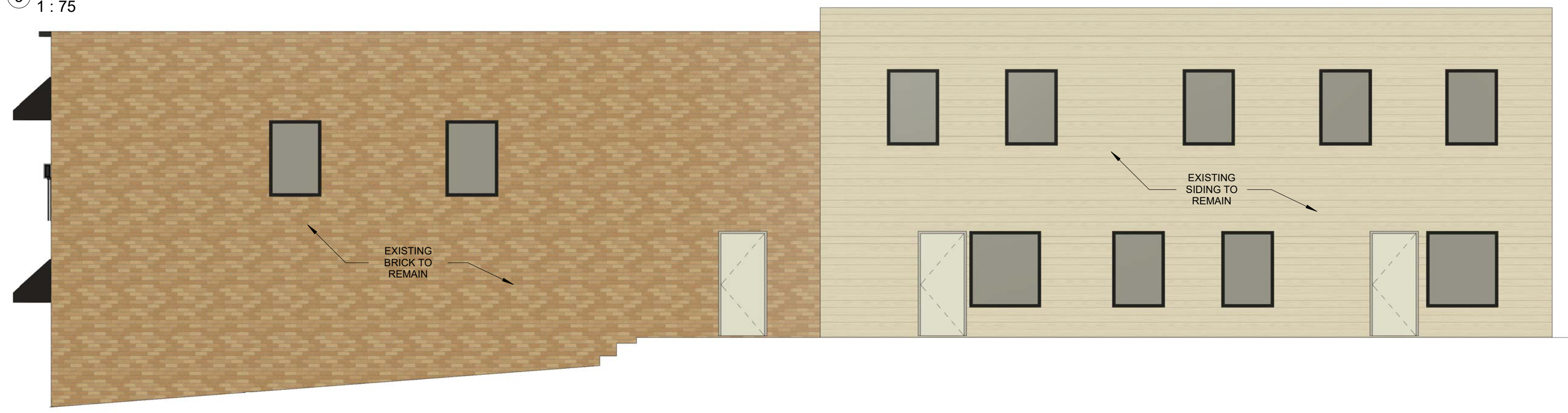
1 EAST ELEVATION - EXISTING NOT ALTERED 1:75

EXISTING NORTH AND EAST BUILDING FACES TO REMAIN. NO ALTERATION WILL BE DONE TO THESE FACES